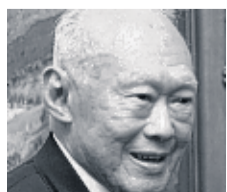
Lee: he mesmerised the Labour cabinet in 1968